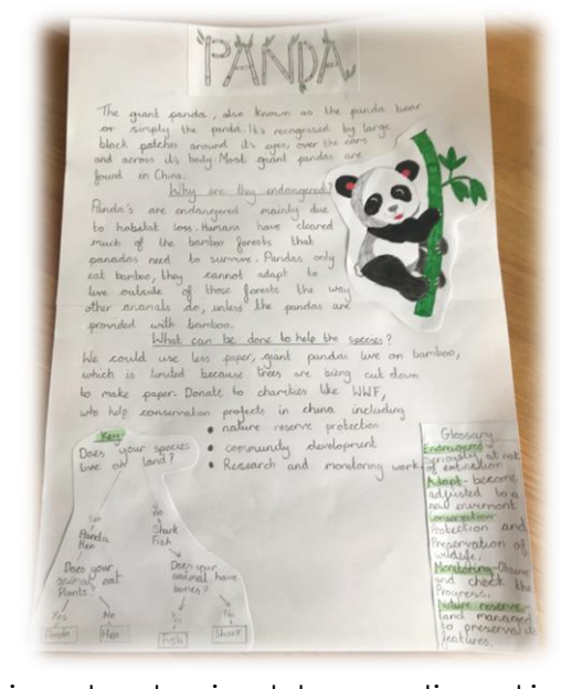
Learning about animals has continued in Year 4

It will not be possible at this stage, but we would like to see it, so send in learning to the class emails. This doesn't have to be pictures but comments are welcome as well. We will aim to celebrate this through the various forms of social media we use.